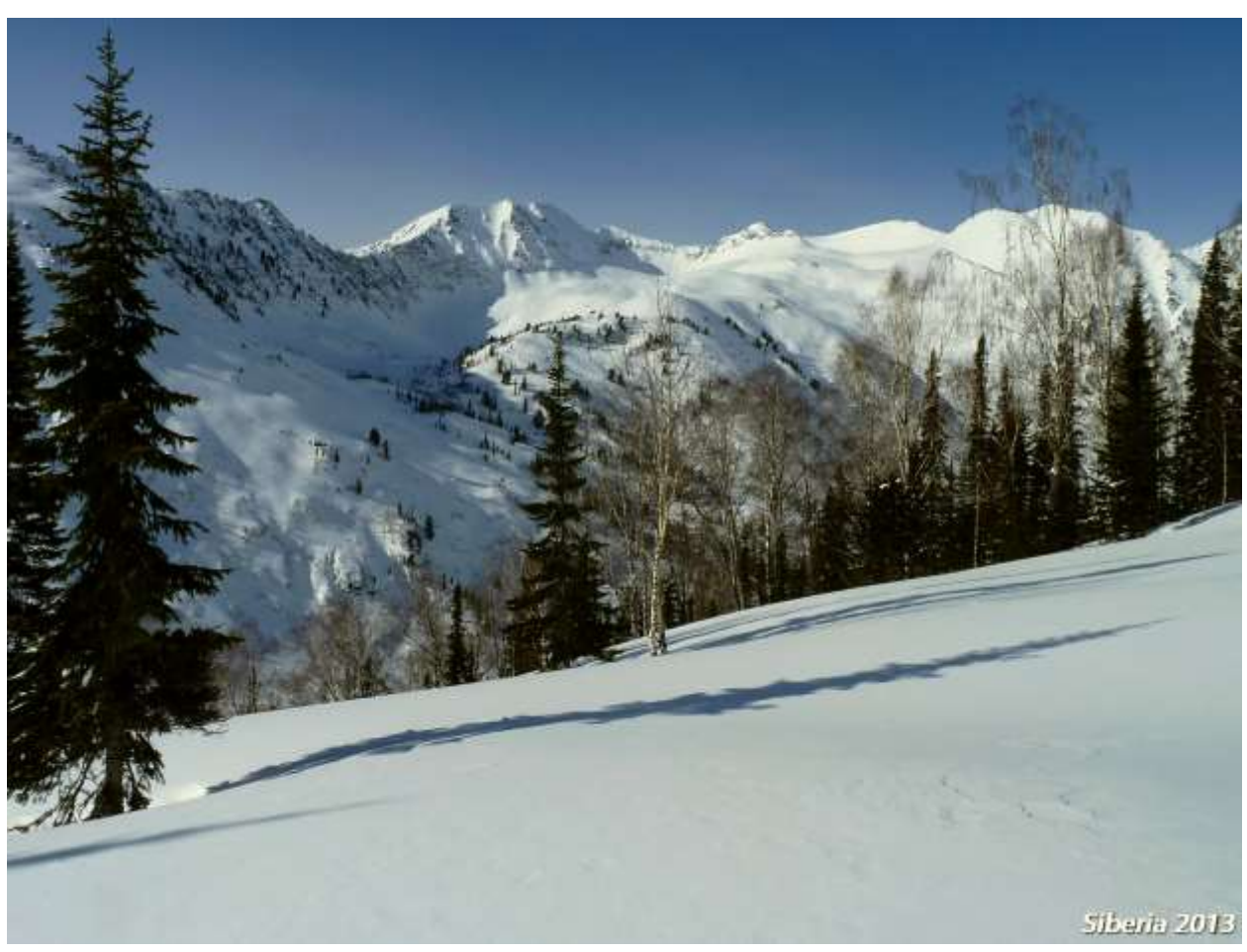
Circus of peak Zapsib

02 JAN/Day 5 It's time to start to get moving. Today ski tour 10km to Kugutu peak 1638m. Night in the hut.