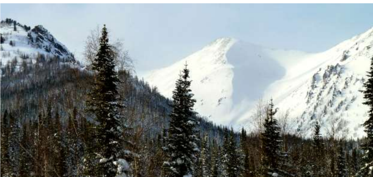
Mt.Bol'shoi Zub, 2045m