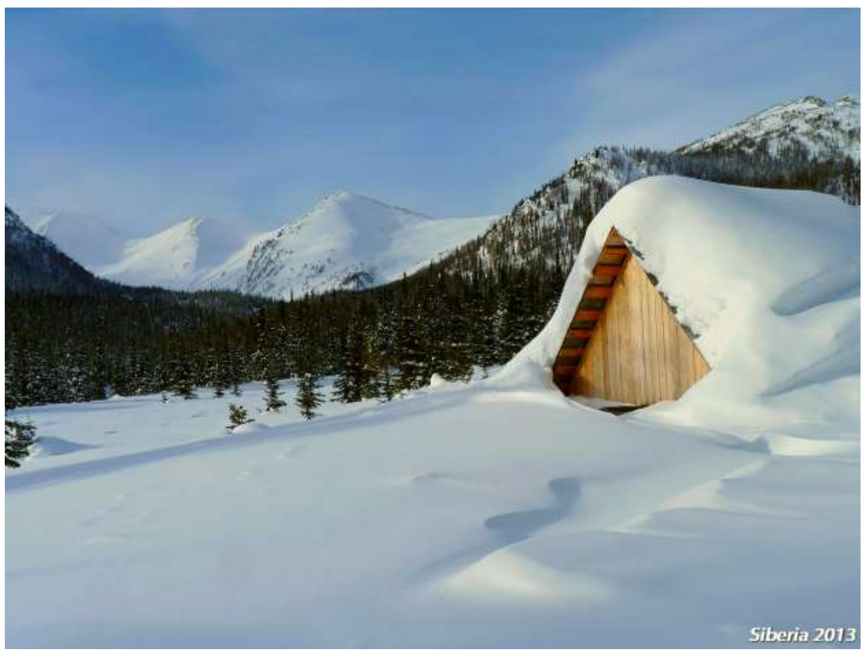
View to the main chain

01 JAN/Day 4 Today is one of difficulties day – after all this celebration and vodka! Because normaly is free day but who want has light ski tour to the nearest mountain and downhill skiing.