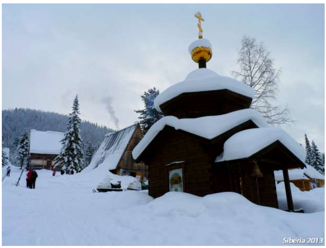
Orthodox church in the taiga forest